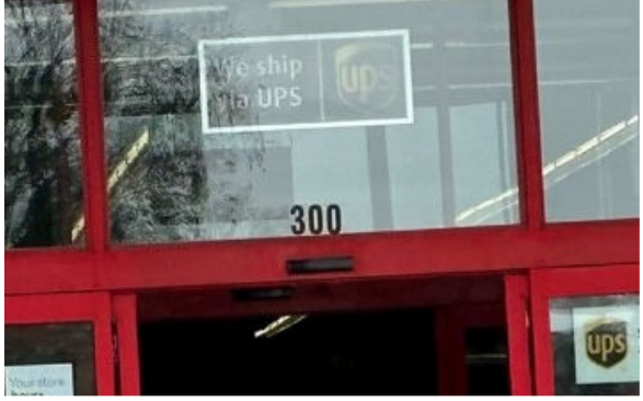
See PI v. Waverly et al, District of Delaware, Case No. 22-cv-1554, D.I. 1 at \P\P 12-

13. As Chief Judge Connolly remarked at one of the hearings in this case, "if you