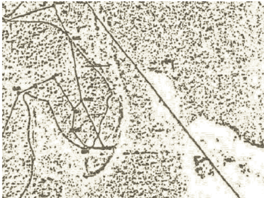
Figure 5 — Aerial Photograph Attached to Borges' Letter to F&WS

In April 1987, Dr. Katzin wrote to the F&WS, identifying himself as owner or part-owner of land “from station 616 at the southern end of the refuge north to a point