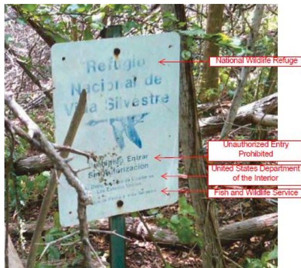
Figure 4 — F&WS sign

of the F&WS property and includes labels for Tract 1f and 1e. See Figure 3 . The survey plat shows Tract 1f bounded by points 606, 607, 609, 610, and 611. Id. at 464–65. The F&WS placed signs at some of the points on the plat that prohibited entry. See Figure 4 . In 2012 and 2013, a F&WS representative located a marker at point 606, and other markers were found at points 600, 601, 602, 603, 605, 612, 613, 614, 617, and 619.