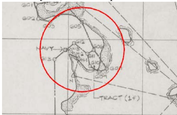
Figure 3 — 1985 F&WS Survey Plat

In 1985, the F&WS surveyed the eastern coast of Culebra. The survey labels several points on the boundaries