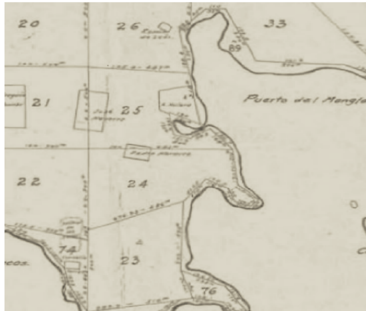
Figure 1 - 1887 Survey

tidal waves in stormy weather when the tide is not perceptible”—was held by the Spanish government in the public domain. Id. at 446–47.